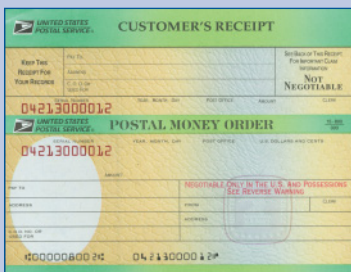
Point of Service (POS) Money Order