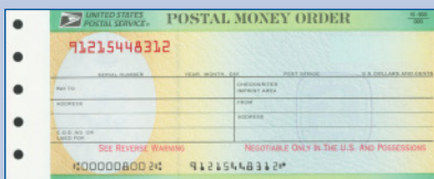
Postal Money Order (PMO)